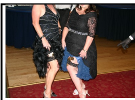
A moll can't be too careful! Casino Night