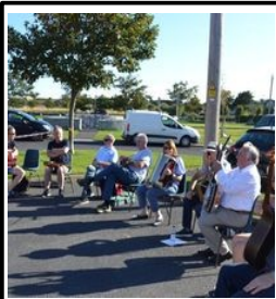
Cois Farrage Band at Pizza Trad