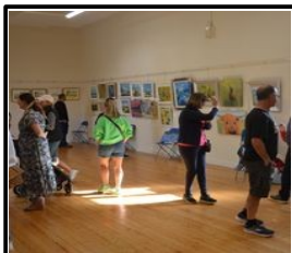
Art & Photography Exhibition