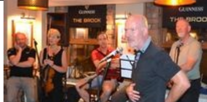
Ceomhaltas Leithinis at the festival Launch