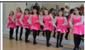
Louise Flood dancers at Mol an Óige