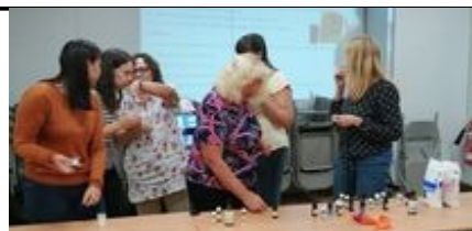
Potions and Lotions Workshop