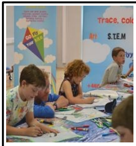
“Go Fly Your Kite”