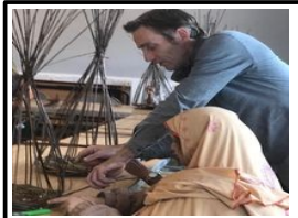
Basket Weaving Workshop