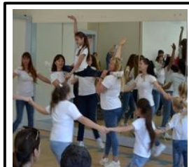
Members of the Ukrainian community at Mol an Óige