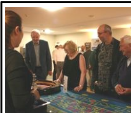
Gambling fun at the Casino Night!