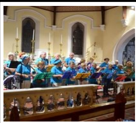
Skerries Strummers at the Gala Concert