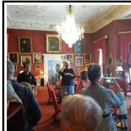
Tour of Newbridge House