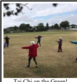
Tai Chi on the Green!