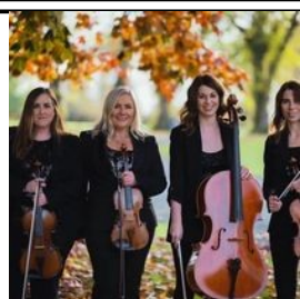
The Dublin String Quartet