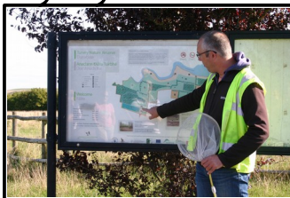
Take a Walk on the Wild Side!