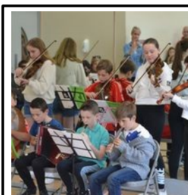
Mol an Óige